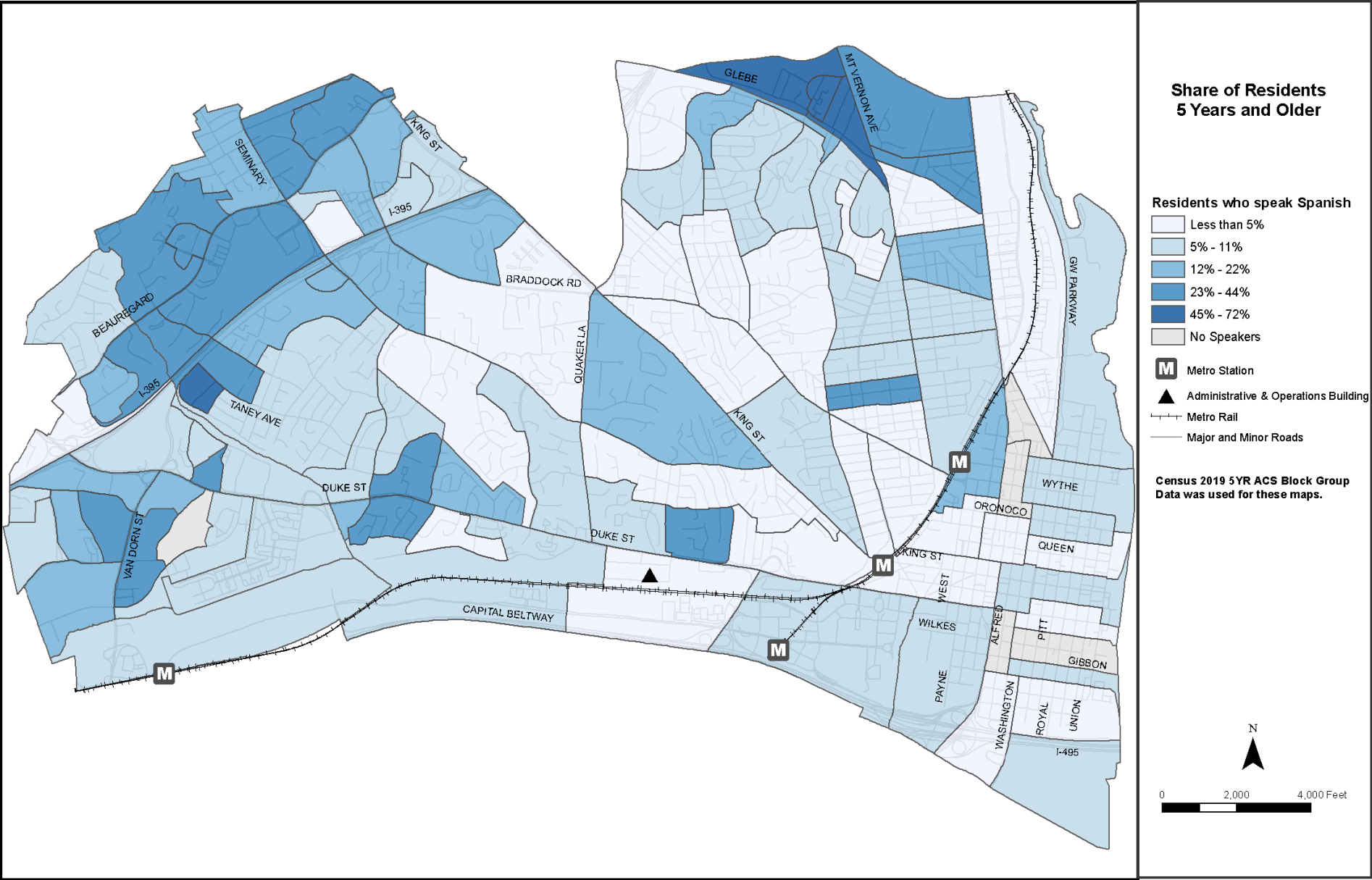
Figure C1. Residents ages 5 and older who speak Spanish at home